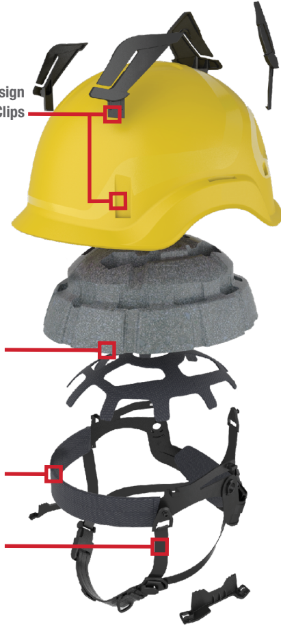
Detachable 3-Point Chinstrap