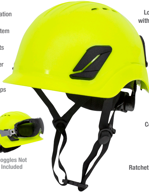
Goggles Not Included