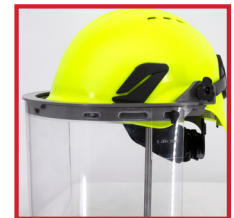
Bracket fits most universal hard hat faceshields

⚠ WARNING: Cancer and reproductive harm - www.P65warnings.ca.gov