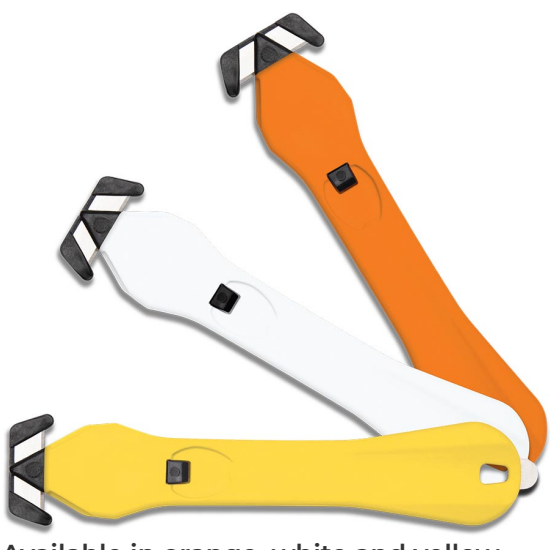
Available in orange, white and yellow.