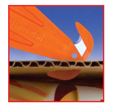
Klever Innovation's focus on safety is designed to reduce cut injuries and damaged goods.