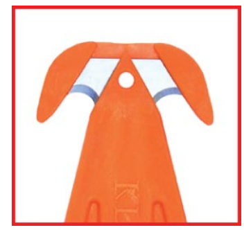
KURVE More cutting surface produces smoother, easier cuts and reduces material bunching.