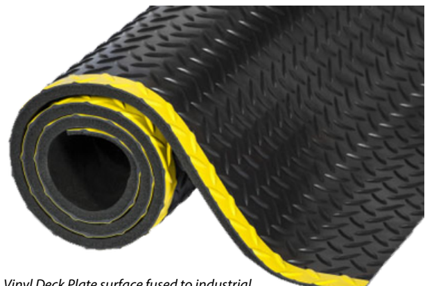
Vinyl Deck Plate surface fused to industrial grade PVC foam backing offers comfort.