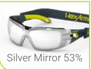
Silver Mirror 53%