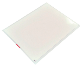
White, Single Sheet