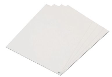
White, Re II