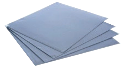
Gray, Re II