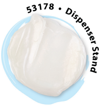
53178 • Dispenser Stand