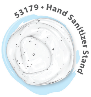
53179 • Hand Sanitizer Stand