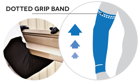
DOTTED GRIP BAND

No more slipping! Sleeves with arm openings featuring "STAYz-Up" technology hold up—comfortably gripping onto underlying fabric or skin to ensure sleeves stay in place, and keep you protected no matter what. Unlike other products on the market, we won't let you down.