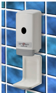
Soft & Silky