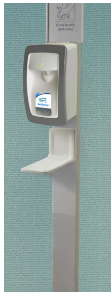
Freestanding Floor Stand with No Touch Dispenser