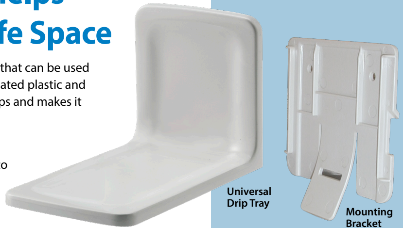
Universal Drip Tray

The Universal Drip Tray can be used in restrooms, kitchens, hallways, waiting rooms or wash stations. Simply install a drip tray beneath any dispenser located on a wall or one of our floor stands.