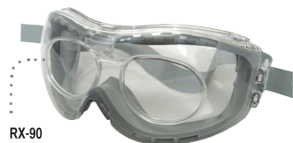
RX-90 Rx insert clear

Built-In Ventilation Channels Provides extra fog control and ventilation