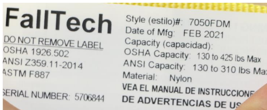
Figure 3.1: Identification Tag