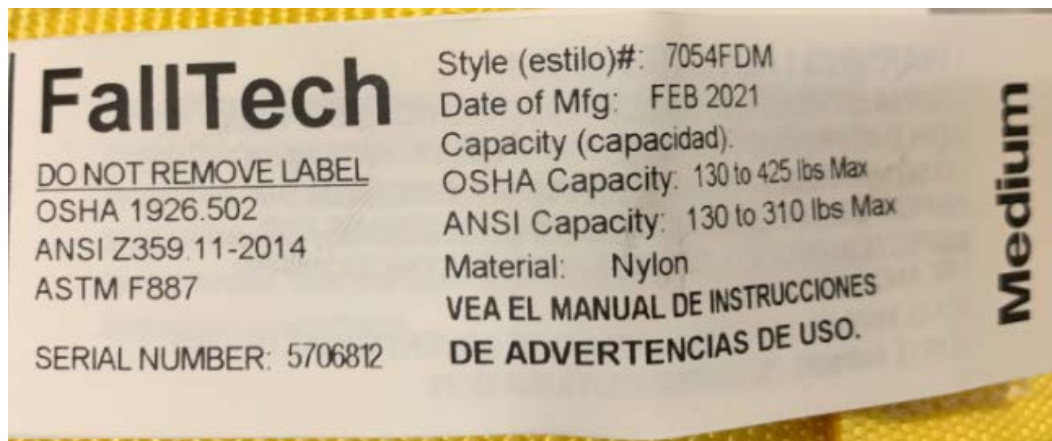
Figure 3.1: Sample photo of Identification Tag

Sample description: Falltech, Harness Sample identification: Style 7054FDM Manufacturer: Falltech Material of webbing: Yellow Nylon with Nomex Kevlar Ripstop Leg and Shoulder Yoke Pads Number of samples tested: 12 Deviations: None Note: Product modified from as-received state. Suspension Trauma Safety Strap Packs removed from harness prior to testing, as requested by the manufacturer.