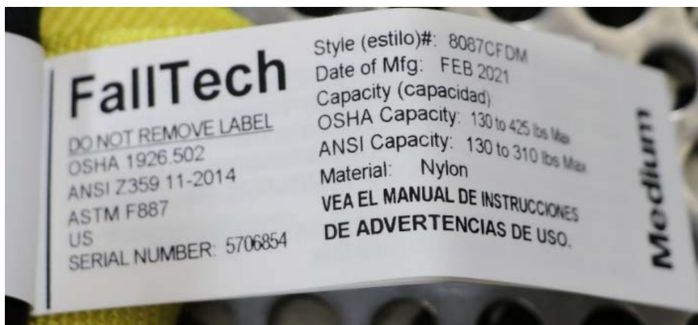
Figure 3.1: Sample photo of Identification Tag

Sample description: Falltech, Harness Sample identification: Style 8087CFDM Manufacturer: Falltech Material of webbing: Yellow Nylon Number of samples tested: 12 Deviations: None