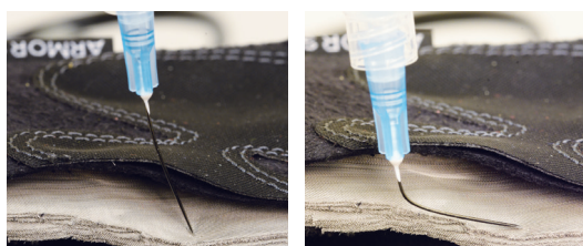
25 gauge needle buckling 25 gauge needle failure