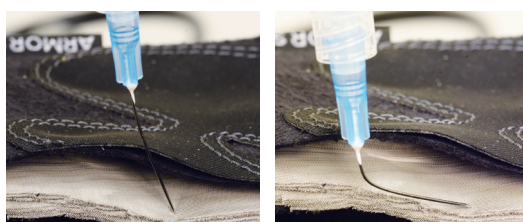
25 gauge needle buckling 25 gauge needle failure