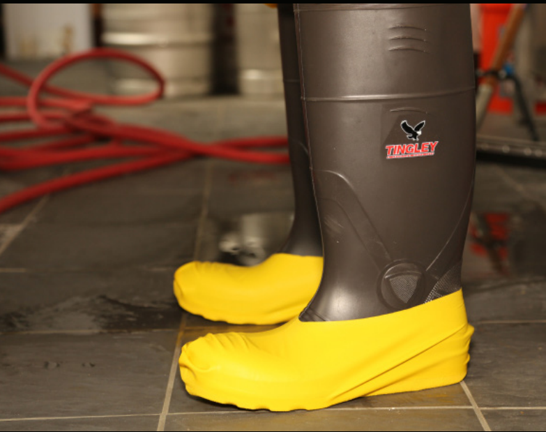
Boot Saver shoe covers are perfect for the color coded world of food processing by helping prevent cross-contamination.