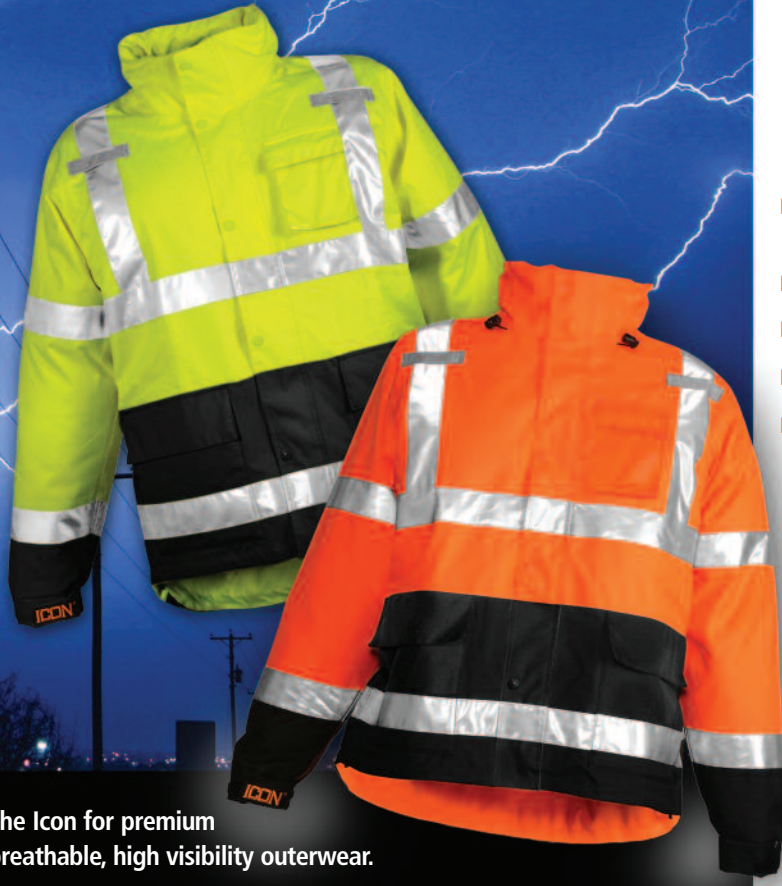
The Icon for premium breathable, high visibility outerwear.