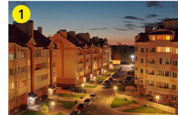
PARKING AREAS Pole Mounted Area Flood Lighting