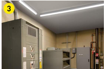
MECHANICALS Strip Lights Ceiling Lights