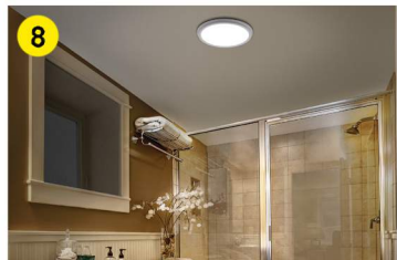
BATHROOMS Recessed Lighting Flushmount Lighting Vanity Mirrors/Lights Fan Lighting