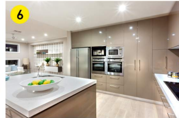
KITCHENS Recessed Lighting Under Cabinet Lighting Flushmount Lighting NightLightR