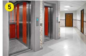
LOBBY Panels Downlights