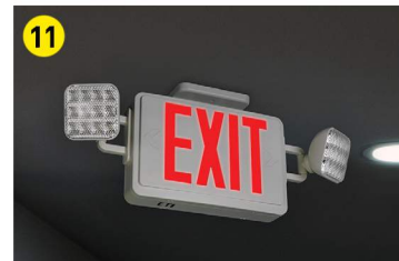
HALLWAY/STAIRWELL Exit Lighting Panels Wrap Lights Sconce