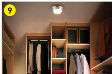
CLOSETS Spin Lights® Flushmounts