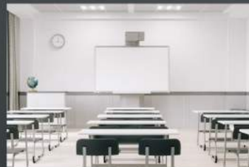
CLASSROOMS/ ADMINISTRATIVE OFFICES