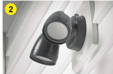
OUTDOOR SPACES Bollards Floodlights Wall Packs Security Lighting