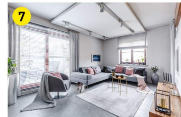
FAMILY ROOM Recessed Lighting Flushmount Lighting Track Lighting