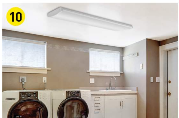
LAUNDRY ROOMS Recessed Lighting Flushmount Lighting Fan Lighting