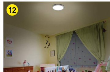
BEDROOMS Flushmounts Downlights Cove Lighting NightLightR